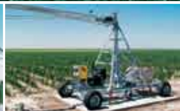
Four Wheel Towable Pivot Systems