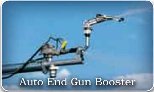
Auto End Gun Booster

T-L has options for any field, any crop.