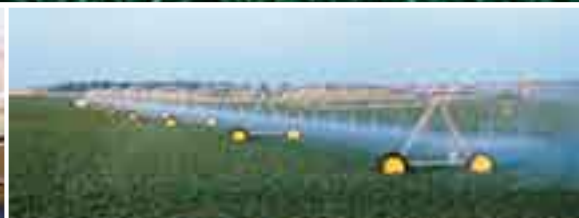
T-L Home Office at Hastings, NE